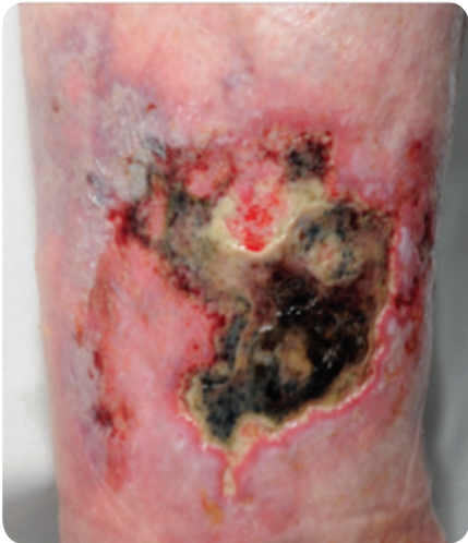
Figure 2. Ulcer at presentation.