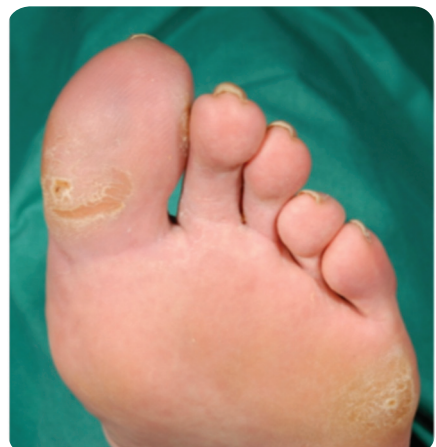
Figure 7. Complete healing after three weeks of treatment.

at dressing change, thereby ensuring that the surrounding fragile skin and newly-formed granulation tissue is protected.