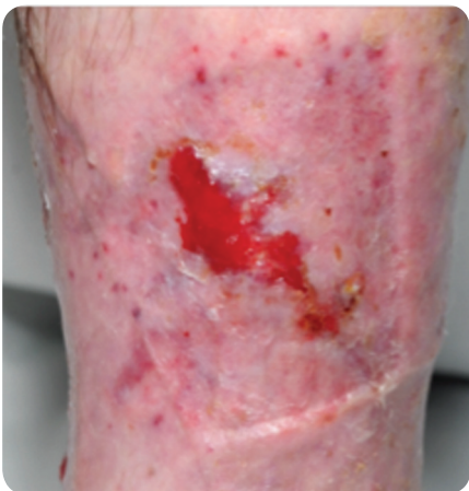
Figure 3. Mr W's ulcer at four weeks since referral.