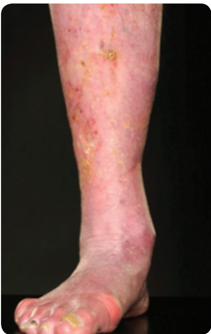
Figure 4. Fully healed after eight weeks of treatment.

in the author's clinical experience, foam dressings provide the perfect balance between fluid-handling capabilities and maintaining moist wound healing.