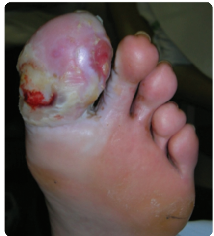
Figure 6. 48 hours after treatment with Advazorb.